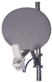
CSM 130 Subscriber Module with optional Passive Reflector Dish